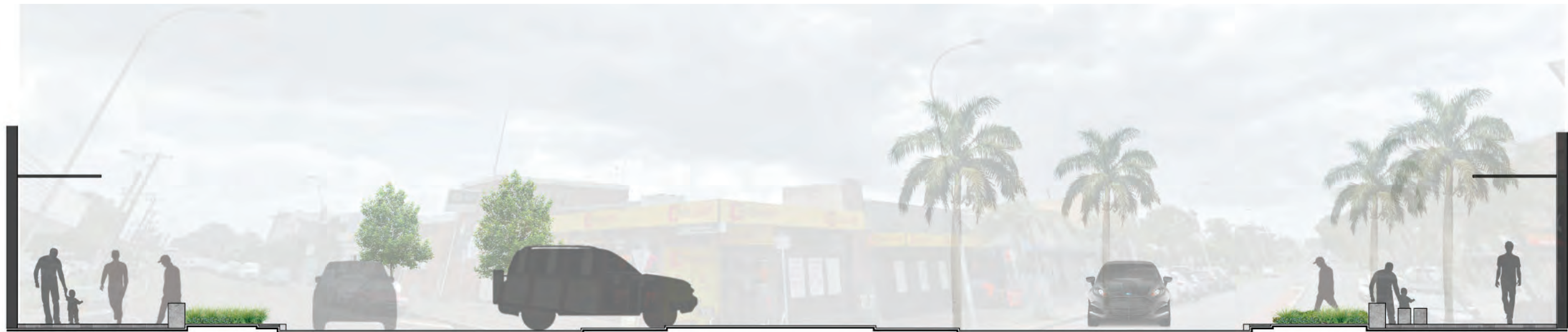
SECTION - B