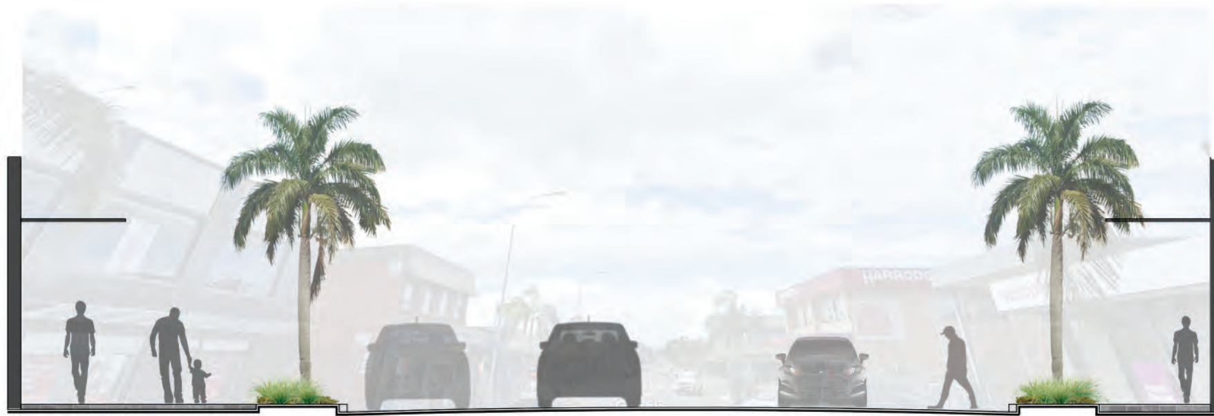
SECTION - A