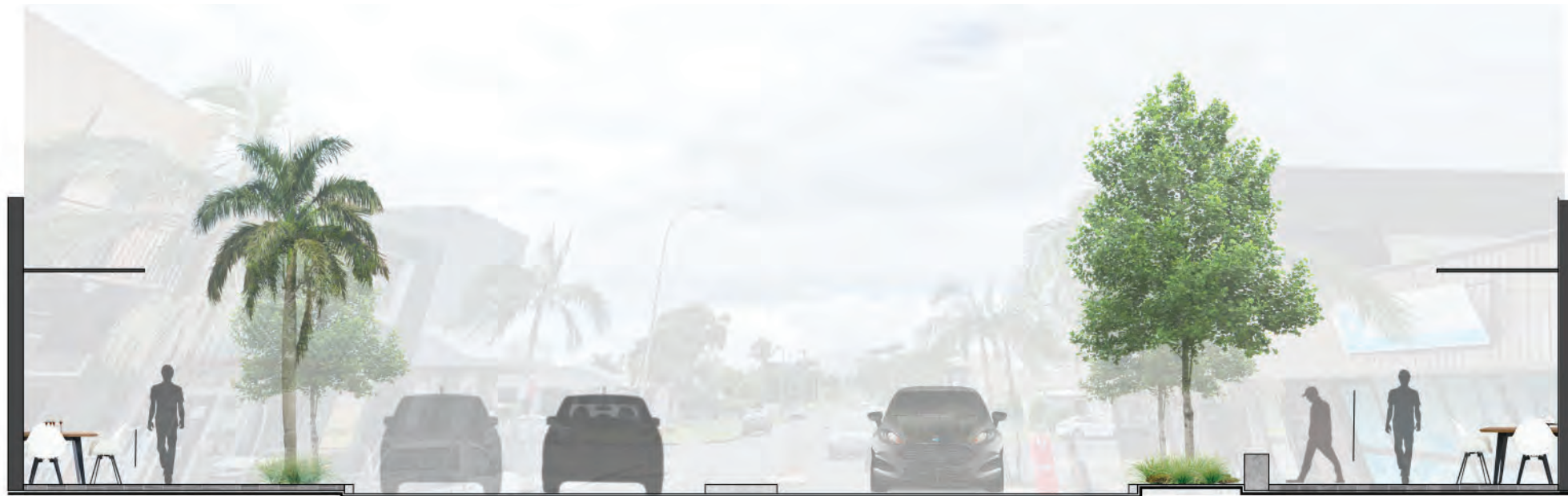
SECTION - C