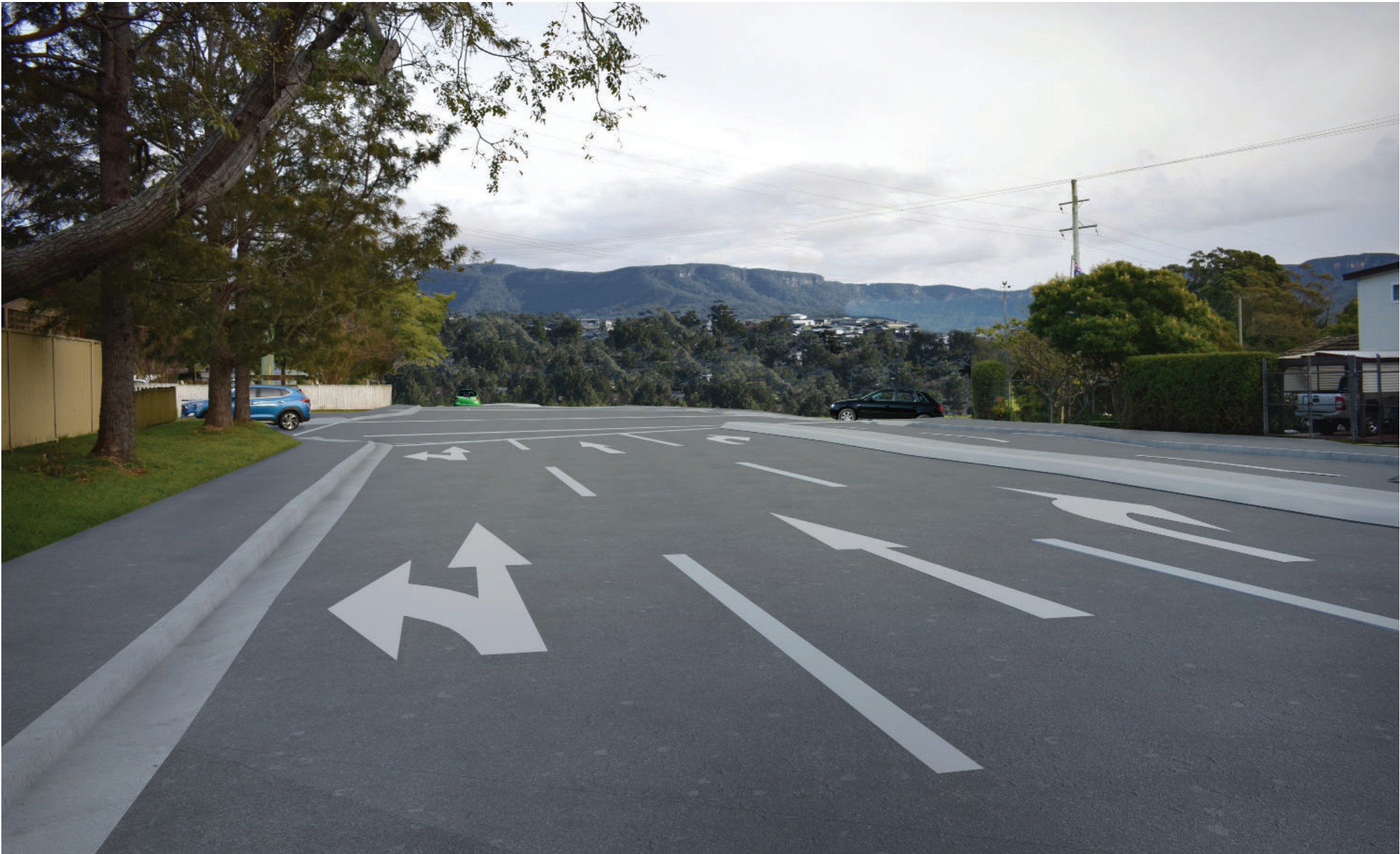
AFTER (ARTIST IMPRESSION)- LOOKING WEST ONTRIPOLI WAYTOWARDSTHE CALDERWOOD ROAD INTERSECTION