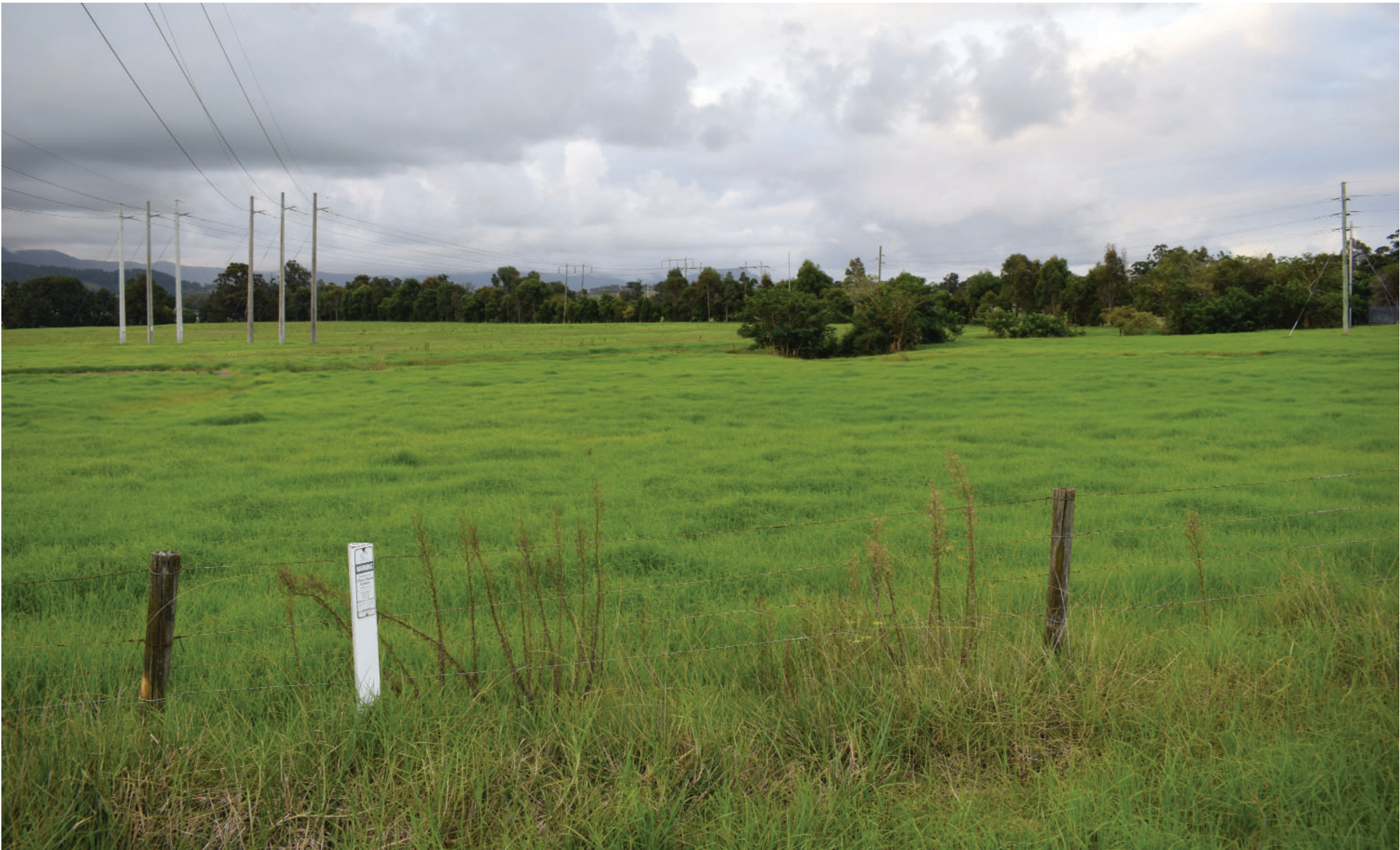
BEFORE (EXISTING CONDITIONS)- LOOKING NORTH TOWARD THE EXISTING RURAL LANDSCAPE TO BE INTERSECTED BY TRIPOLI WAY EXTENSION