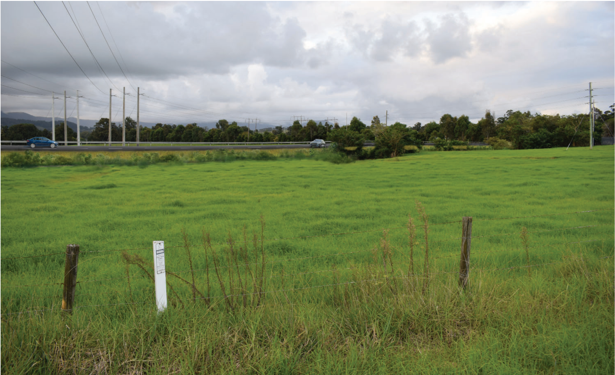
AFTER (ARTIST IMPRESSION)- LOOKING NORTH TOWARD THE EXISTING RURAL LANDSCAPE TO BE INTERSECTED BY TRIPOLI WAY EXTENSION