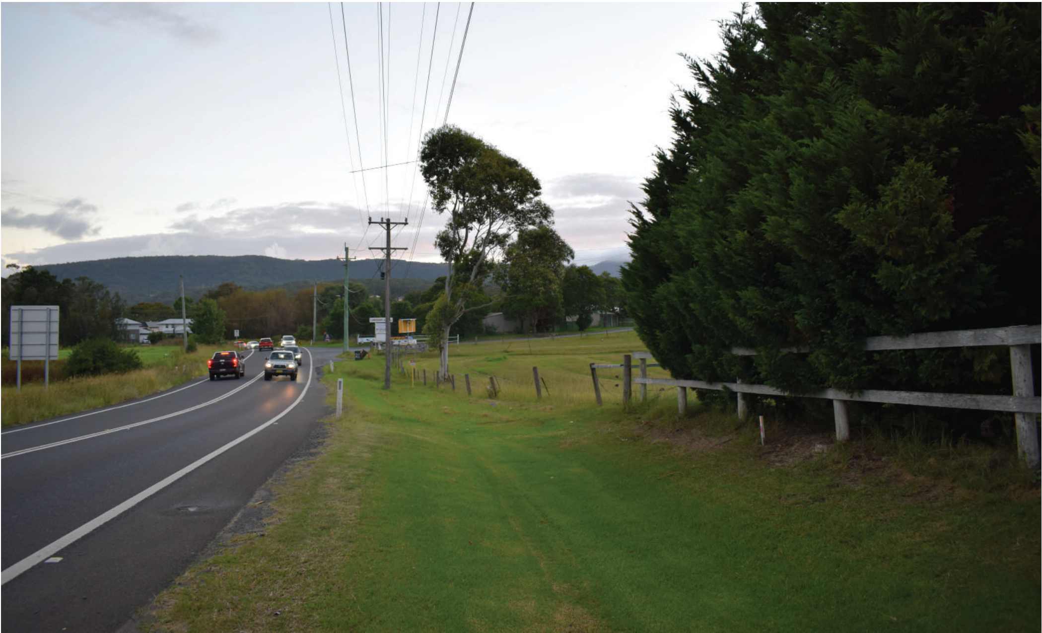
BEFORE (EXISTING CONDITIONS)- LOOKING SOUTH ON TERRY STREET TOWARDS INTERSECTION WITH TRIPOLI WAY