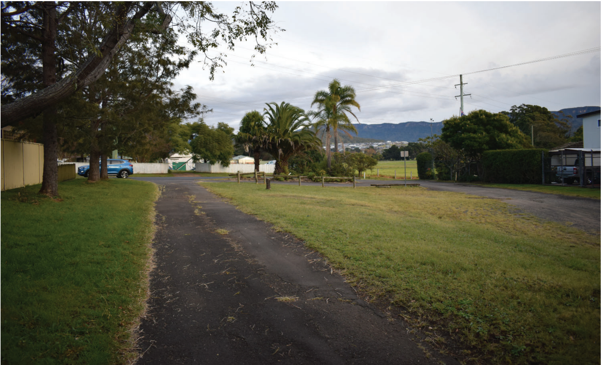
BEFORE (EXISTING CONDITIONS)- LOOKING WEST ONTRIPOLI WAYTOWARDSTHE CALDERWOOD ROAD INTERSECTION