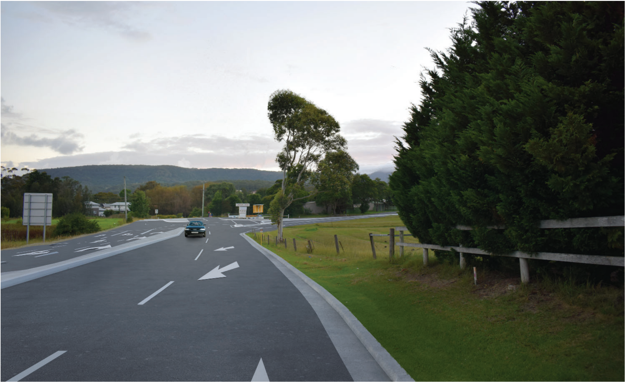
AFTER (ARTIST IMPRESSION)- LOOKING SOUTH ON TERRY STREET TOWARDS INTERSECTION WITH TRIPOLI WAY