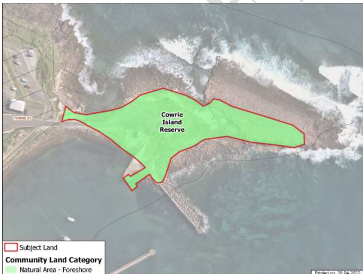
Figure 3 – Land category.