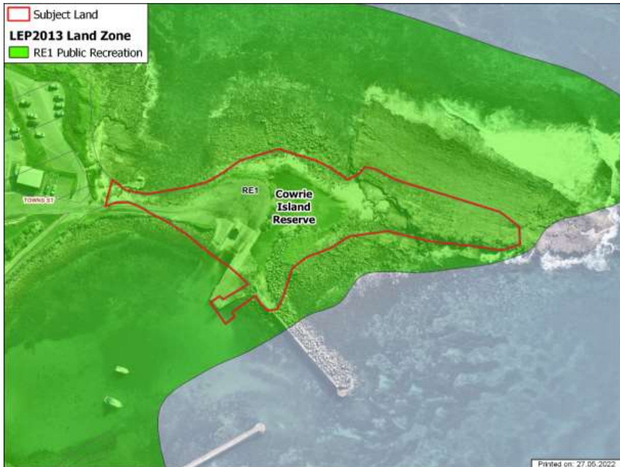
Figure 4 – Land Zones.

Cowrie Island Reserve is zoned RE1 Public Recreation under the Shellharbour Local Environmental Plan 2013 (LEP). The reserve adjoins other lands zoned RE1 – Public Recreation. Land zones are shown in Figure 4 below.