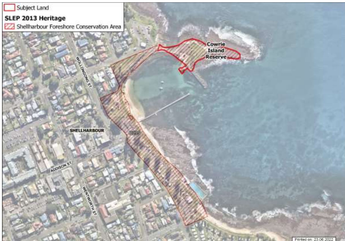
Figure 5 - Shellharbour Foreshore Heritage Conservation Area

Shellharbour Foreshore Conservation Area is a unique cultural landscape, with outstanding local heritage significance for Shellharbour and its people. Its special character is derived from historical layers set within a public reserve, in a quaint, and increasingly rare, historic seaside village.