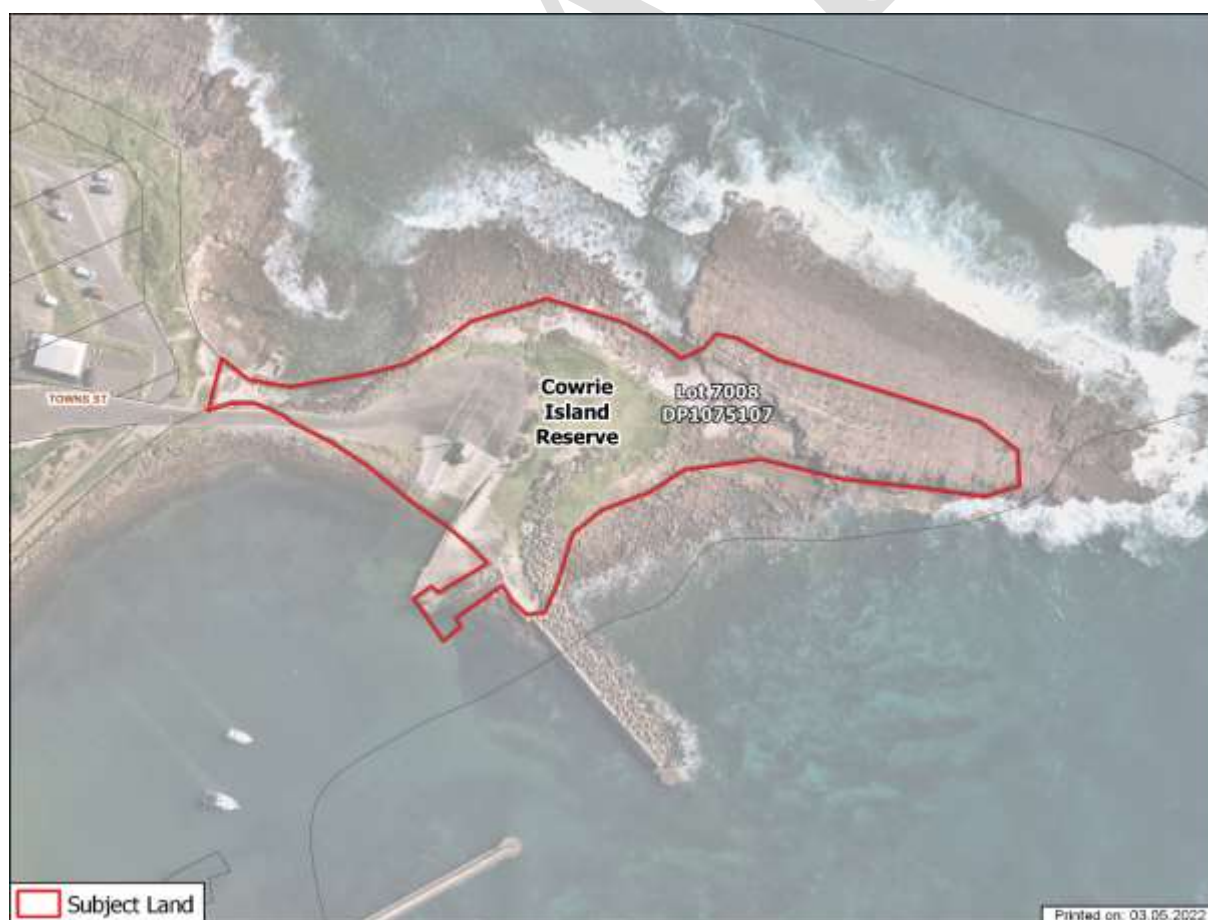
Figure 1 – Land to which this Plan applies.

See Figure 1 below for land to which this Plan applies.