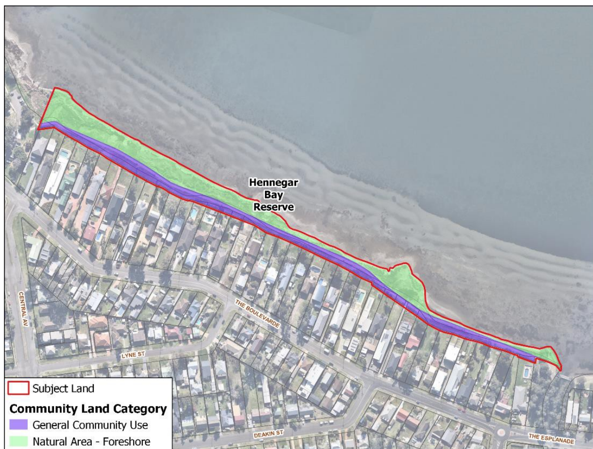
Figure 3 – Land categories