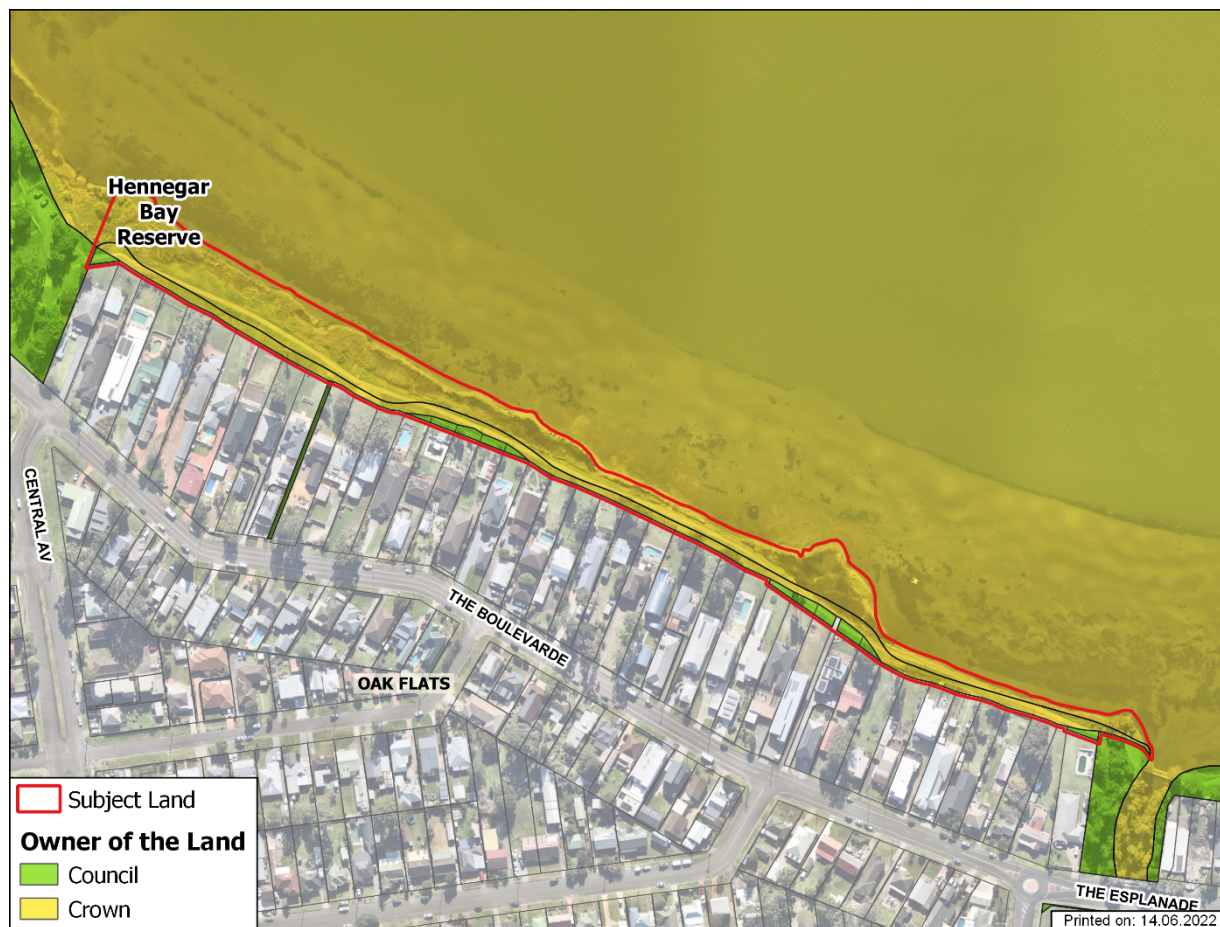
Figure 2 – Owners of the land.