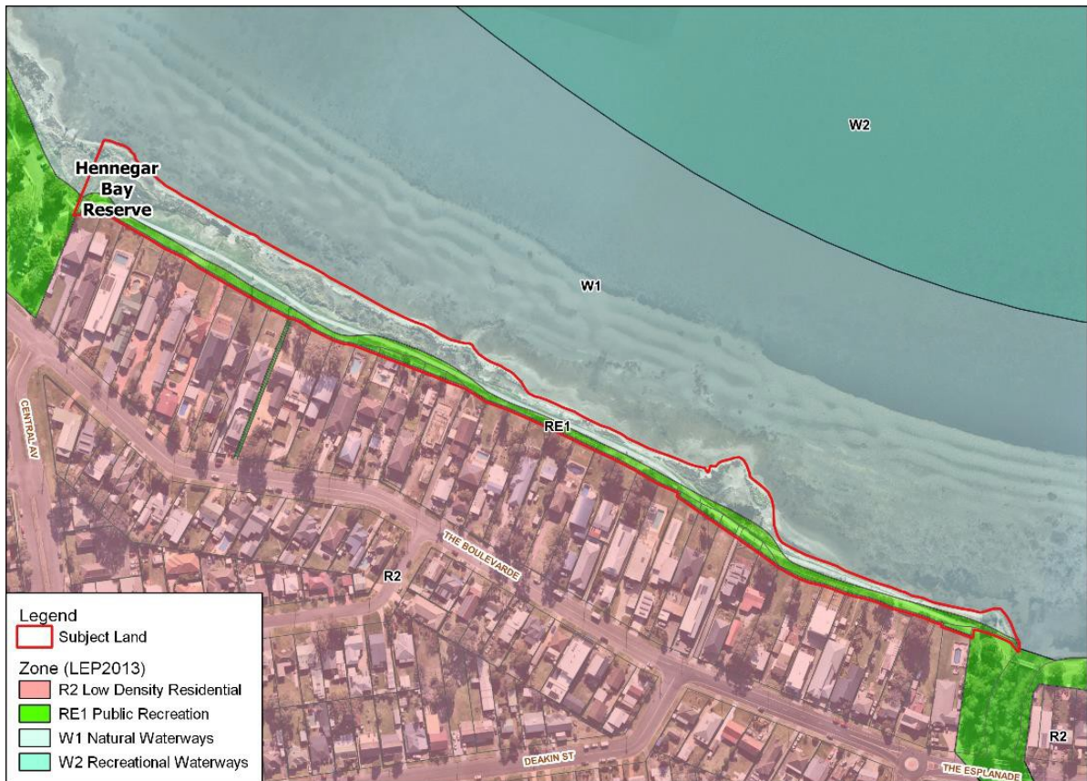
Figure 4 – Land Zones

Hennegar Bay Reserve is zoned RE1 Public Recreation and W1 Natural Waterways under the Shellharbour Local Environmental Plan 2013 (LEP). The reserve adjoins other lands zoned W1 – Natural Waterways and R2 – Low Density Residential. Land zones are shown in Figure 4 below.